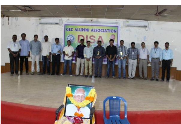
Group Photo of Alumni members